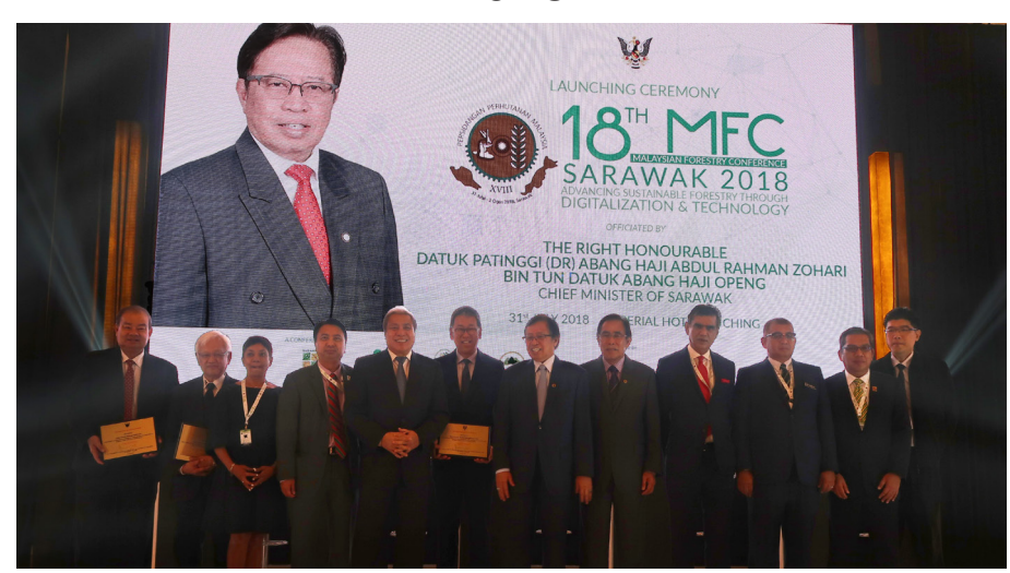
Photo: The Chief Minister of Sarawak flanked by other quests of honour and representatives of Forest Management Units (FMUs) who are present to receive their SFM Certificates.

The 18th Malaysian Forestry Conference exchange and share information, views (MFC) themed "Advancing Sustainable and experiences in the administration, Forestry through Digitalization and management and development of Technology" was organised Forest Department Sarawak (FDS) same time establish closer working in partnership with Sarawak Forestry Corporation Sdn Bhd (SFCSB) from 31 July to 2 August 2018 at Imperial Hotel, Kuching.