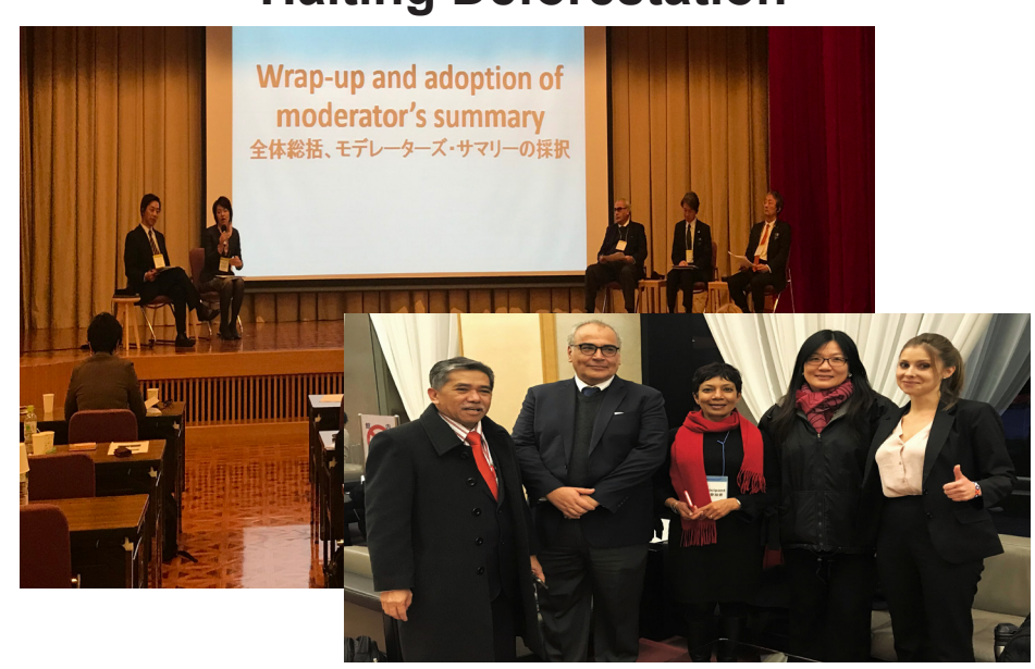
Photo: (top) Panel Members at the wrap-up session with two moderators; (bottom) Group

The International Symposium on the sector in Japan toward the achievement Conference Hall in Tokyo, Japan.