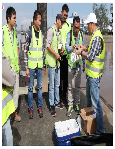
Photo: (clockwise) The Trainer introducing participants to equipments used for water quality monitoring; The Trainer demonstrating water sampling protocols on site; Participants in groups of five (5) collecting water samples and in-situ readings.

ATraining on Environmental Quality Monitoring course was organised by Chemsain HRD Sdn Bhd, in collaboration with the Natural Resources and Environment Board (NREB) and Sarawak Timber Association (STA) from 30 January to 1 February 2018 at Kemena Hotel, Bintulu.