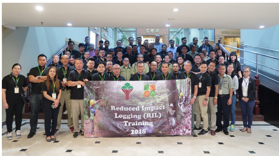
Photo: Participants of the Training posing for a group photo

Forest Department Sarawak (FDS) and Sarawak Forestry Corporation (SFC) had revised the Reduced Impact Logging (RIL) Guidelines for Ground-based Harvesting System for implementation by the forest timber licenses in Sarawak that undertake Forest Management Certification (FMC). In view of this, a series of training was conjointly organised by FDS and SFC in four (4) separate sessions in the month of September 2018 in Miri and Sibu. Participants of the Training comprised representatives from FDS, SFC and Sarawak Timber Association (STA) as well as the forest operators.