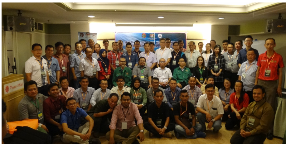
Photo: Group photo of participants of the Campaign with the organising committee

The 10 th series of Campaign on Occupational Safety and Health (OSH) for the Timber Industry in Sarawak was recently concluded at Premier Hotel, Sibu from 4 to 5 September 2018.