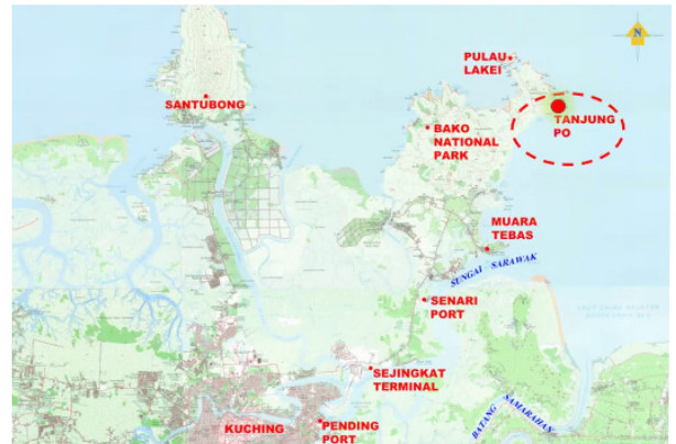
Location of Tanjung Po, Kuching

古晋港务局于2020年8月4日通过视频会议与利益相关者进行丹戎埔深海港总体规划研究对话会。对话会获得私人领域，州政府部门和公会包括砂拉越木材公会的参与，并旨在收集对丹戎埔深海港总体规划研究的反馈意见。砂州政府已经任命 Jurutera Minsar Consult Sdn Bhd 为该研究的顾问。