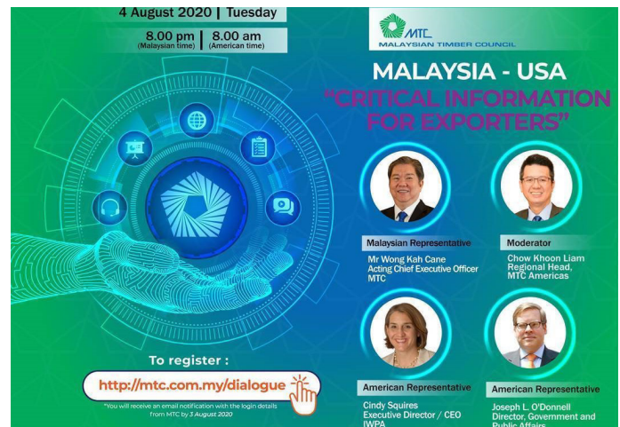
Transpacific webinar “ Malaysia-USA: Critical Information for Exporters ” jointly organised by MTC and IWPA

IWPA turut bercakap mengenai penguatkuasaan Akta Lacey oleh pihak berkuasa yang memerlukan pengimport mengisytiharkan spesies atau semua spesies yang mungkin dijumpai dalam produk kayu yang diimport.