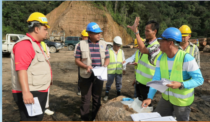
STA participated in the Stage 2 audit for Melatai-Para Forest Management Unit (FMU), Kapit, 22-26 April 2019