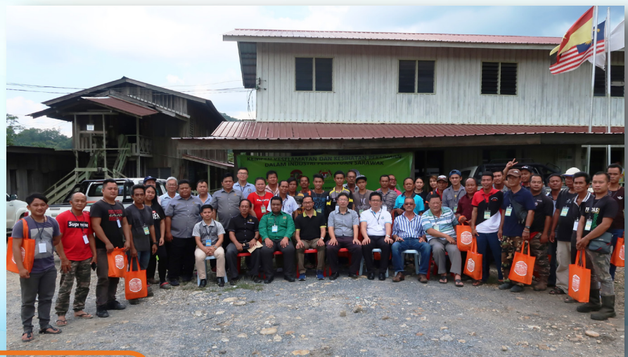
15 th Occupational Safety and Health (OSH) Campaign for Timber Industry, Lubok Lalang Base Camp, Limbang, 5-6 November 2019