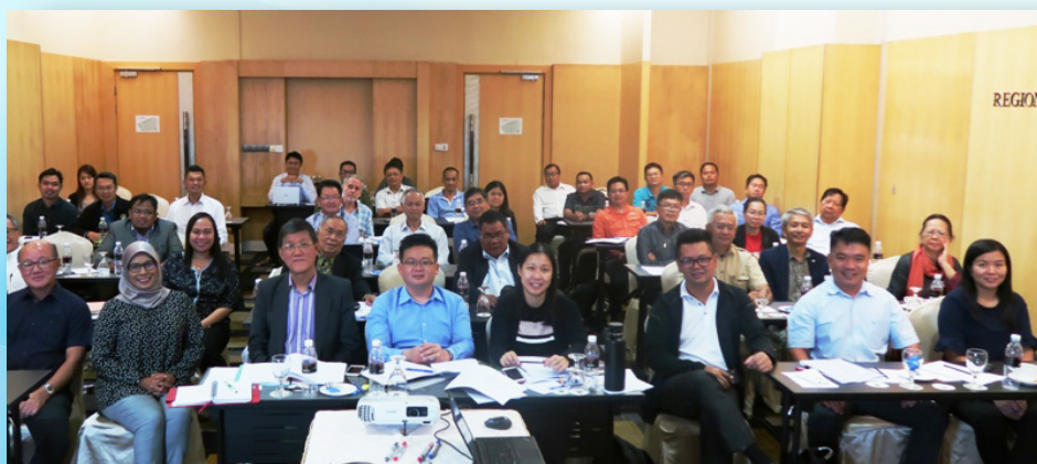
STA participated in the Regional Consultation on the Enquiry Draft of Malaysian Criteria and Indicators for Forest Management Certification [MC&I (FMC)], Imperial Hotel, Kuching, 4 July 2019