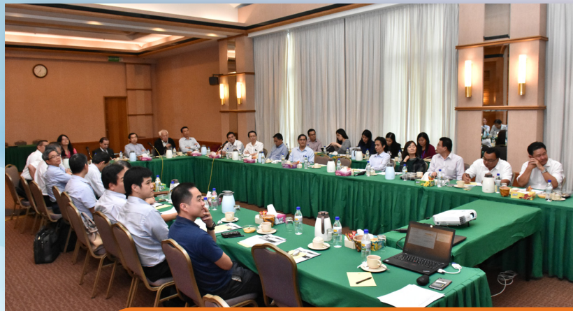
Meeting on 7-year Limitation to Carry Forward Unabsorbed Business Losses, Unutilised Reinvestment Allowances and Investment Allowance, Wisma STA, Kuching, 15 January 2019