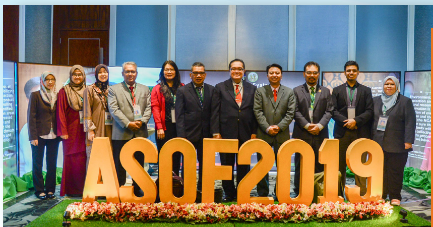
Malaysian delegation at the 22 nd Meeting of the ASEAN Senior Officials on Forestry and Its Related Meetings, Makati City, Philippines, 18-19 July 2019