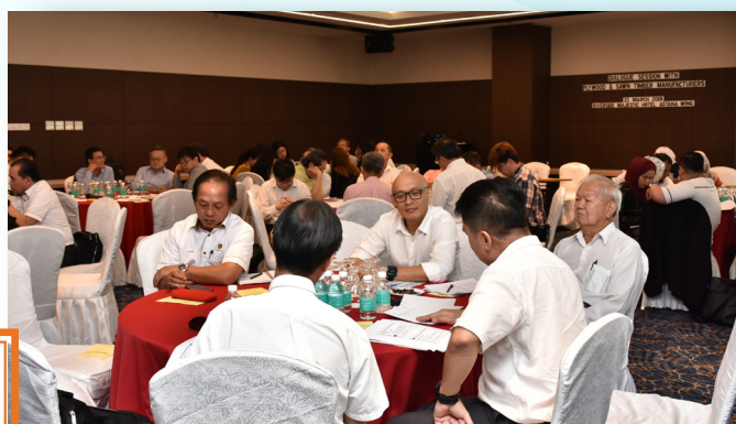
Dialogue Session with STA plywood and sawn timber members organised by Sarawak Timber Industry Development Corporation (STIDC), 21 March 2019