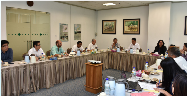
STA Forest Plantation Committee Meeting No 2/2019, Wisma STA, Kuching, 9 April 2019