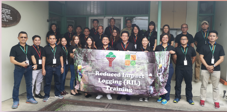
Training on Reduced Impact Logging (RIL), SFC Regional Office, Kuching, 19-21 June 2019