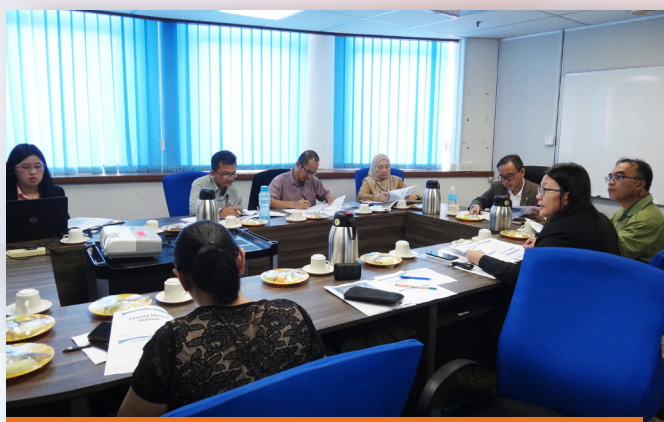
Meeting on Harvesting Costs called by Forest Department Sarawak (FDS), Wisma Sumber Alam, Kuching, 18 November 2019