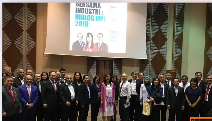
STA participated in the Dialogue 2019: Ministry of Primary Industries (MPI) Consultation with Industries, Putrajaya International Convention Centre, Putrajaya 6-8 August 2019