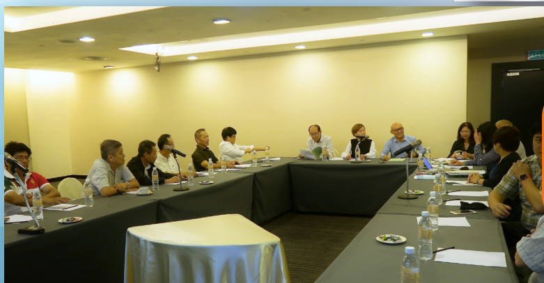
Joint Committee Meeting of STA Timber Products Marketing and STA Sawmilling No 1/2019, Tanahmas Hotel, Sibul, 13 March 2019