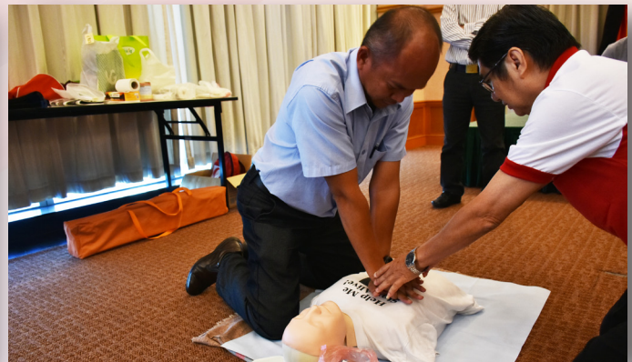
Basic First Aid and Cardiopulmonary Resuscitation (CPR) Training Course conducted by the Malaysian Red Crescent Society (MRCS) Kuching District, Wisma STA, Kuching, 21-22 May 2019