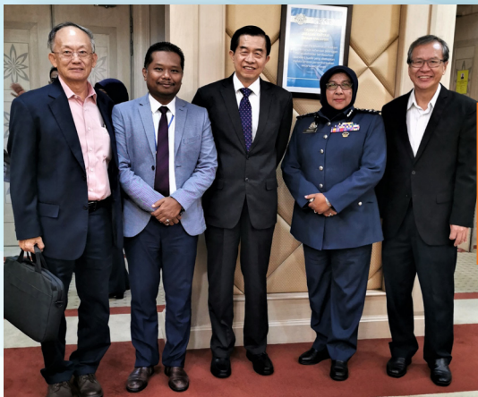
Sales and Service Tax (SST) Implementation Technical Committee Meeting No 2/2019, Royal Malaysian Customs Department (RMCD) Headquarters, Putrajaya, 29 August 2019