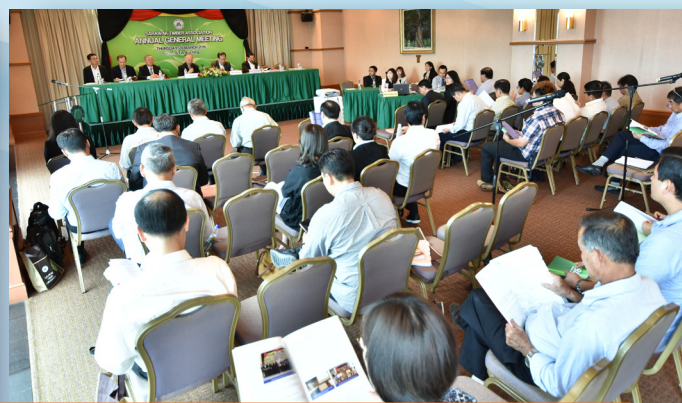
STA Annual General Meeting 2019 & Dialogue with STA Members, Wisma STA, Kuching, 28 March 2019