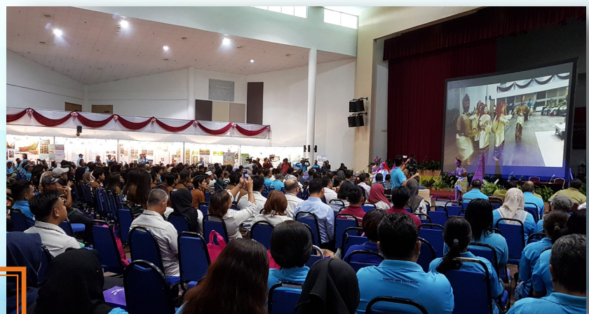
IDF Launching Ceremony, Universiti Putra Malaysia (UPM), Bintulu, 23 March 2019