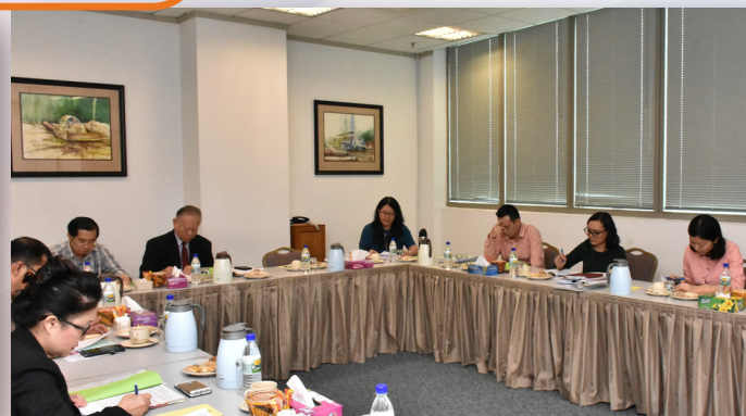
STA Board of Honorary Advisers' Meeting No 1/2019