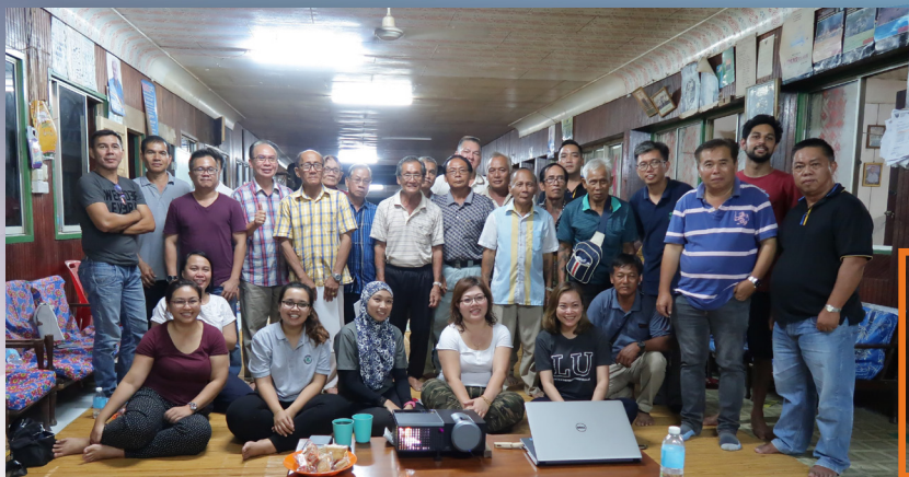
STA participated in the Roadshow on Sustainable Forest Management for Licensee and Community in Mujong-Melinau Forest Management Unit (FMU), Kapit, 21-23 March 2019