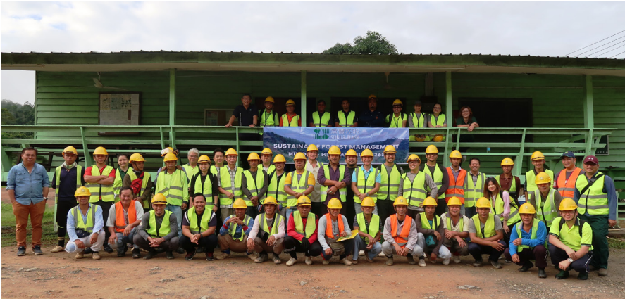
Participants of the stage 2 audit of Mujong-Melinau FMU

The Mujong-Melinau Forest Management Unit (FMU), T/3361, belonging to Subur Tiasa Holdings Berhad, had undergone its stage 2 audit for forest management certification (FMC) under the Malaysian Timber Certification Scheme (MTCs) from 9 to 12 December 2019. The Mujong-Melinau FMU is located between Mujong River and its tributary Melinau River in Kapit Division. Garu Camp is the administration centre of this FMU and it is located about sixty-five (65) kilometres upriver from Kapit Town along Batang Baleh.