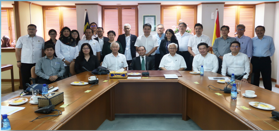
Dialogue Between Sarawak Timber Industry Development Corporation (STIDC) and STA Plywood Members, Wisma Sumber Alam, Kuching, 16 October 2019