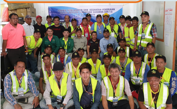
13 th Series of Campaign on Occupational Safety and Health (OSH) for the Timber Industry in Sarawak, Kem Piramid Intan, Kapit, 24-25 April 2019