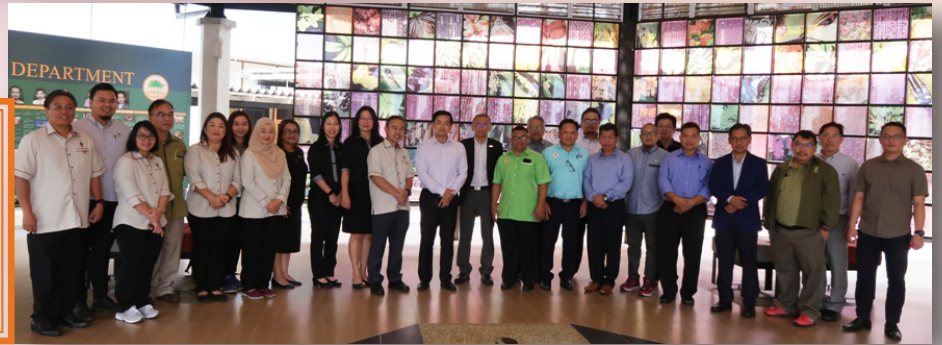
STA participated in the Study Tour to Sabah Forestry Department on Sabah Timber Legality Assurance System (TLAS), Sandakan, Sabah, 24-25 June 2019