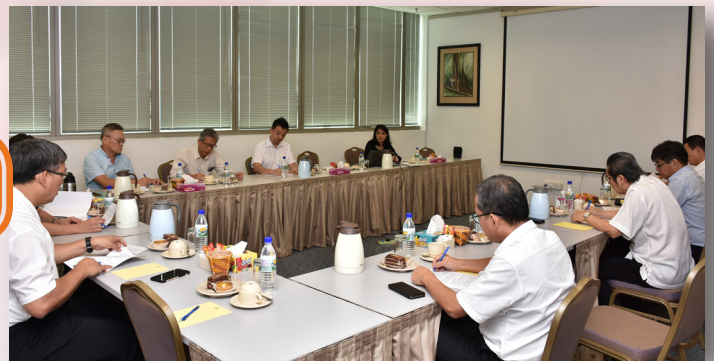
STA Panel Products Committee Meeting No 2/2019, Wisma STA, Kuching, 18 September 2019