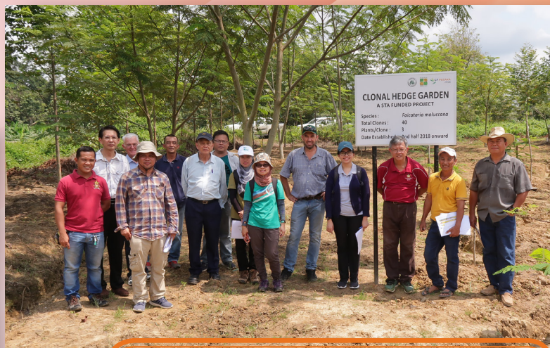
Field Inspection to the STA-funded research project area located at Licence for Planted Forests (LPF) 0043, Samarakan, Bintulu, 7 November 2019