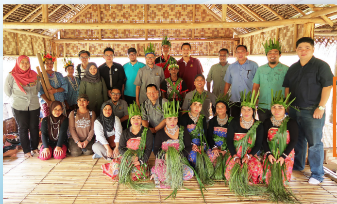
STA participated in the Study Tour to Perak State Forestry Department on the Implementation of Forest Management Certification, 19-23 August 2019