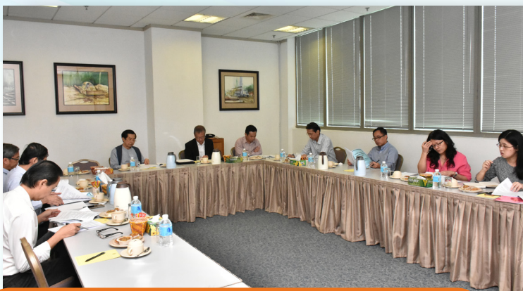
STA Sales and Service Tax (SST) Technical Committee Meeting No 1/2019, Wisma STA, Kuching, 15 January 2019