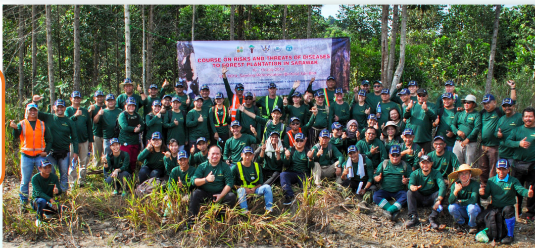
Course on Risks and Threats of Diseases to Forest Plantation in Sarawak, Bintulu, 16-18 July 2019