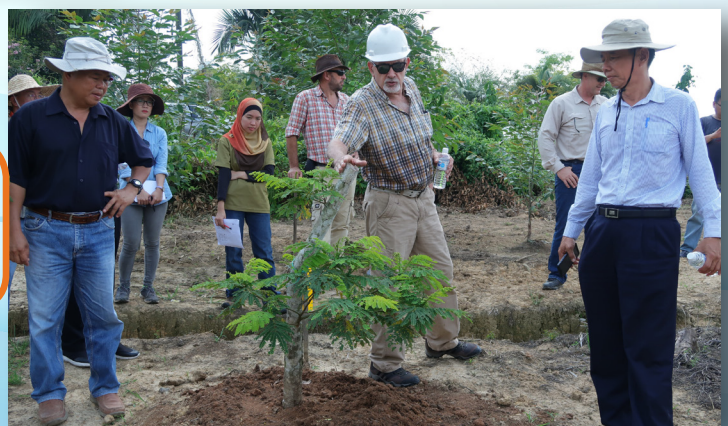
STA Forest Plantation Committee Meeting No 3/2019 cum Field Inspection to STA-Funded Research Project Areas, Samarakan, Bintulu, 23 April 2019