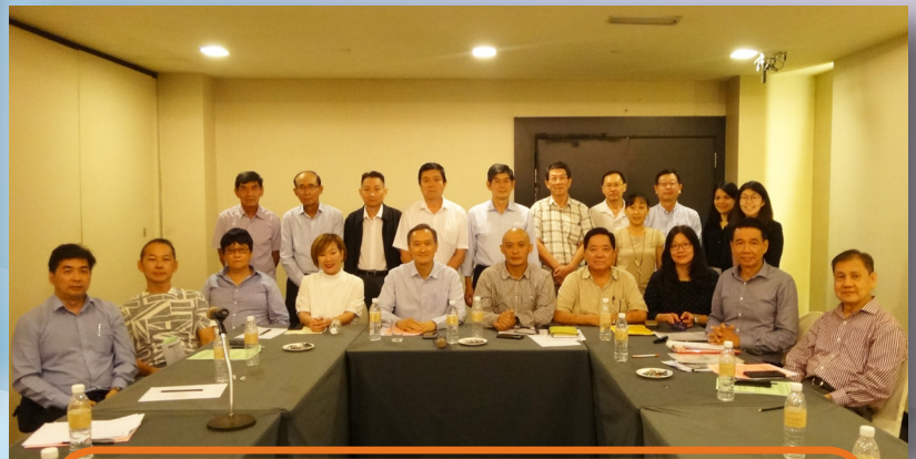
Joint Committee Meeting of STA Furniture & Other Woodworking, STA Moulding, STA Sawmilling and STA Timber Products Marketing, Tanahmas Hotel, Sibul, 29 October 2019