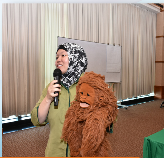
STA Tea Talk "Orangutan – People of the Forest", Wisma STA, Kuching, 23 November 2019