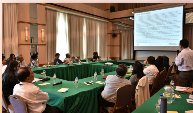
Wisma STA, Kuching, 9 October 2019