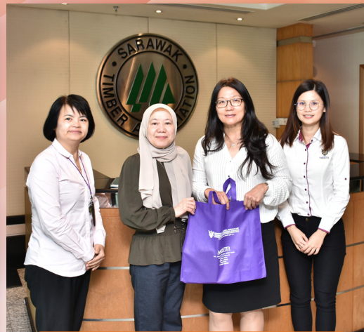
Visit from Ministry of Education, Science and Technological Research (MESTR) Sarawak, Wisma STA, Kuching, 29 July 2019