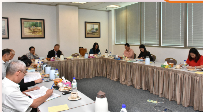
STA Training Sdn Bhd Board of Directors' Meeting No 1/2019