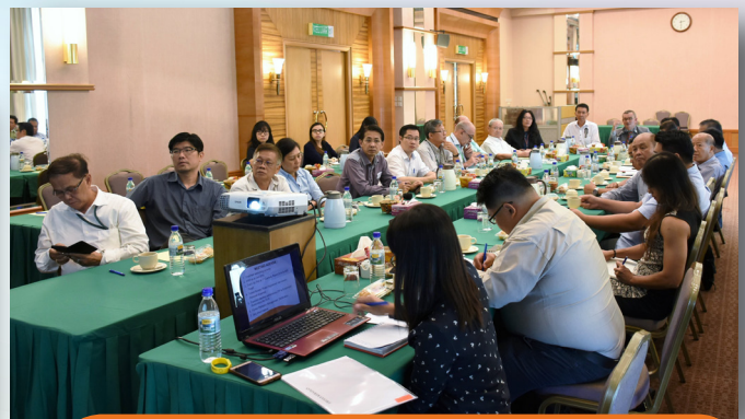
Meeting on Revised Catch-Up Plan cum 2 nd Licences for Planted Forests Quarterly Meeting, Wisma STA, Kuching, 9 April 2019