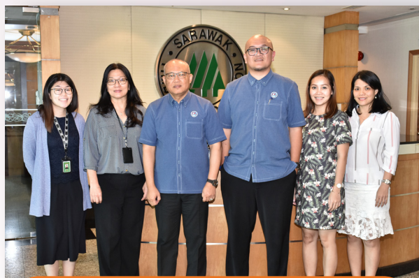
Visit from Tanjung Manis Port Authority, Wisma STA, Kuching, 3 October 2019