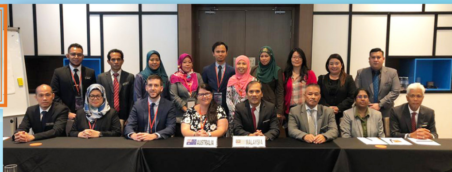
2 nd Batch of Conservation Internship Programme for Forest Management Certification Presentation Ceremony, Waterfront Hotel, Kuching, 18 March 2019