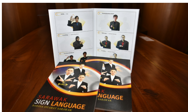
First edition of the book "Sarawak Sign Language"

砂拉越聋哑协会于2019年12月19日推展第一册砂拉越手语(SwSL)书籍，并邀请巴都林当区州立法议员施志豪主持该推展礼。