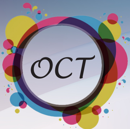
Workshop on Drone Application in Managing Licences for Planted Forests (LPF), Bintulu, 2-4 October 2019