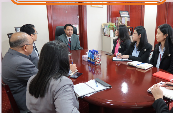
Meeting with the Director of Forests, Wisma Sumber Alam, Kuching, 5 November 2019