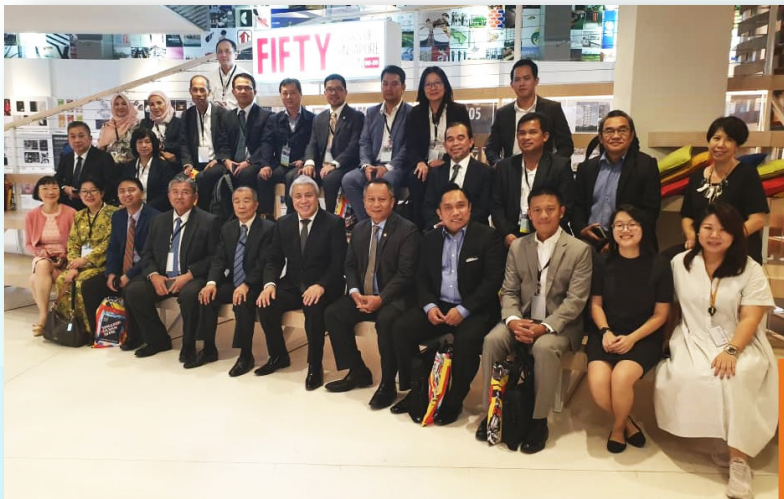
STA participated in the Sarawak Timber and Furniture Selling Mission to Singapore, 3-5 September 2019