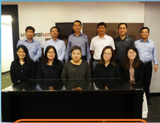
STA Log Marketing Committee Meeting No 1/2019, Tanahmas Hotel, Sibul, 29 October 2019