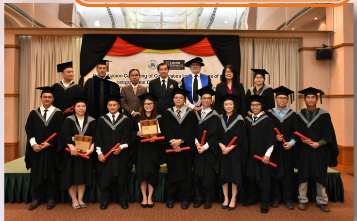
4 th Cohort of the Postgraduate Diploma in Applied Science (Sustainable Tropical Forest Management / Sustainable Tropical Plantation Management), Wisma STA, Kuching, 26 January 2019