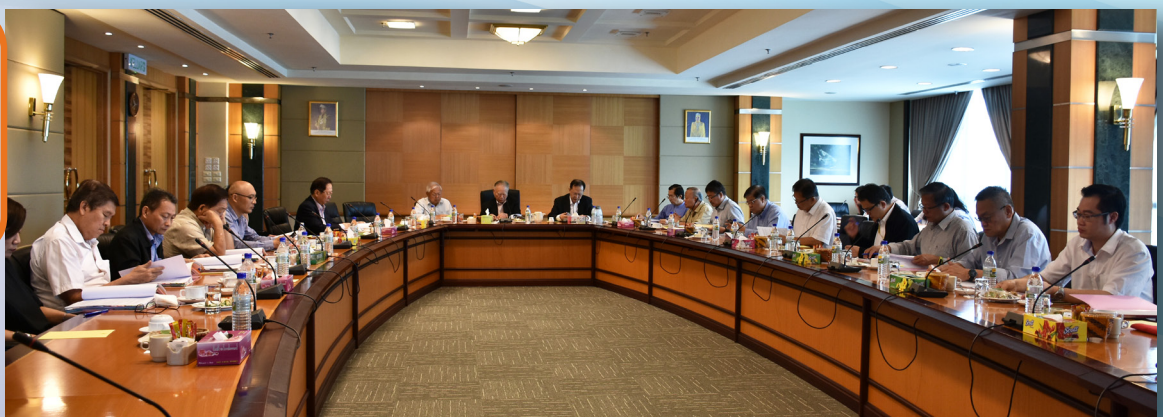
STA Council Meeting No 2/2019, Wisma STA, Kuching, 18 October 2019