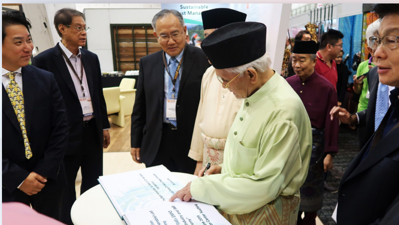
STA participated in the 4 th Sarawak Timber & SMEs Expo 2019, Borneo Convention Centre Kuching (BCCK), 27-30 June 2019