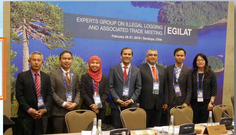
Malaysian delegation at the 15 th APEC Experts Group on Illegal Logging and Associated Trade (EGILAT) Meeting, InterContinental Hotel, Santiago, Chile, 26-27 February 2019