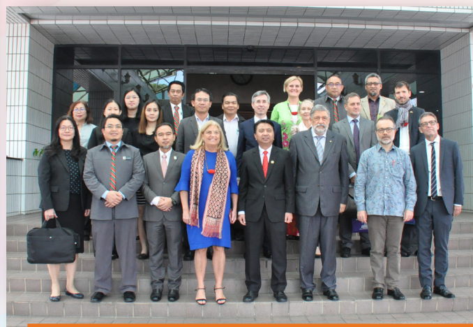
Visit from the Delegation of European Union Embassy in Kuala Lumpur to Forest Department Sarawak (FDS), 19 November 2019