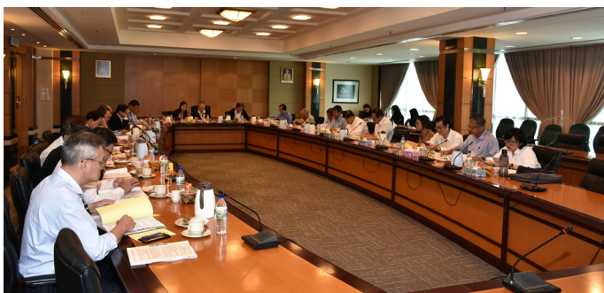
Council Meeting in progress