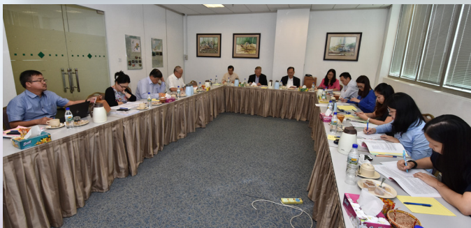
STA Training Sdn Bhd Board of Directors' Meeting No 2/2019