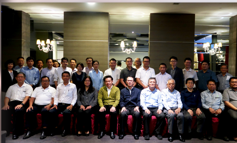
Discussion on Forestry and Timber Industry Master Plan for Sarawak