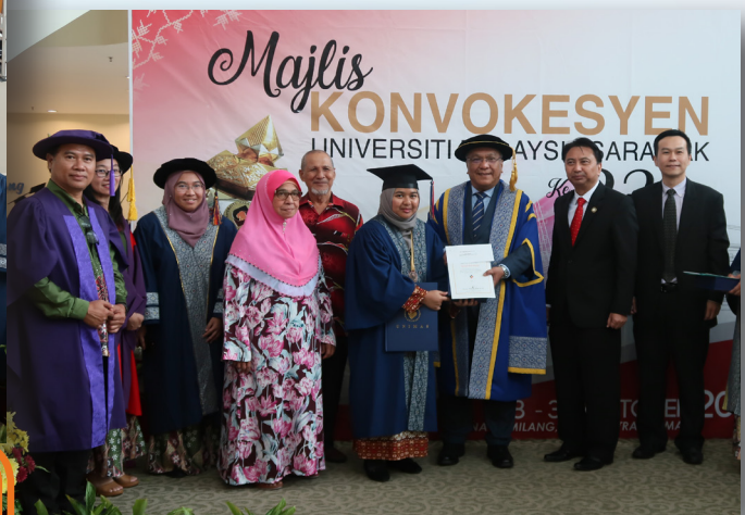
Best Graduating Student