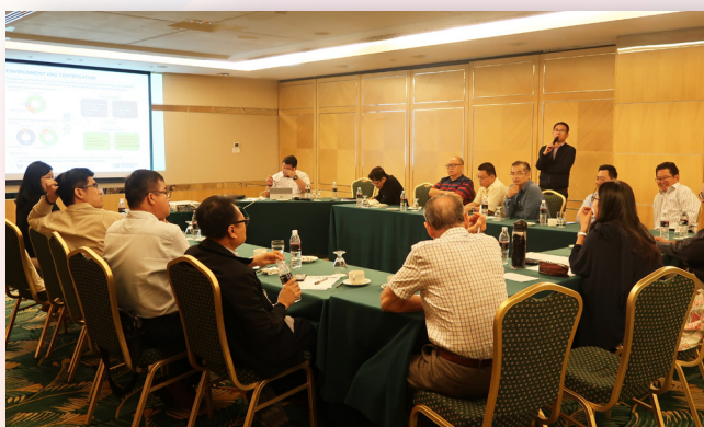
Imperial Hotel, Miri, 8 October 2019