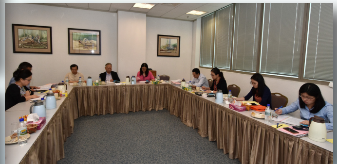
STA Enterprises Sdn Bhd Board of Directors' Meeting No 2/2019