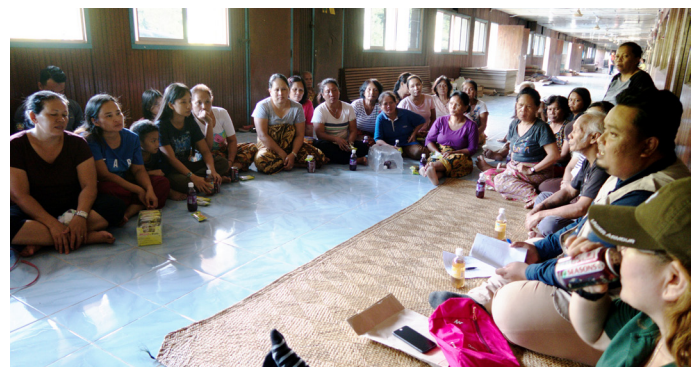
Consultation with the local community

A few major and minor non-conformity reports (NCRs) as well as opportunity for improvements (OFIs) were raised by the auditors during the Closing Meeting. The Mujong-Melinau FMU will be recommended for FMC upon closure of the major NCRs within three (3) months from the date of audit and acceptance of corrective action by the peer reviewers. No verification audit will be required.