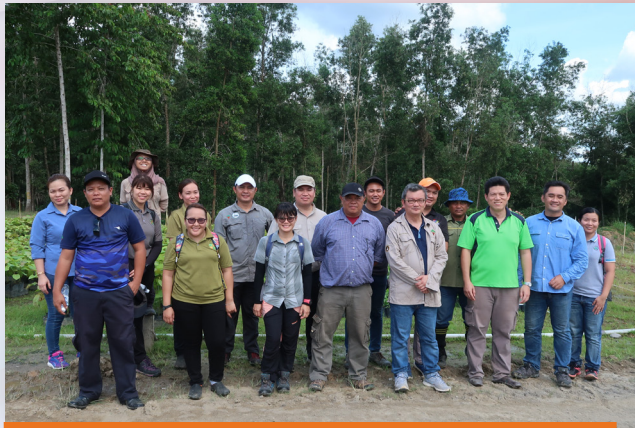
STA participated in the Pilot Project on Aerial Surveillance Study to Detect Ceratocystis Disease Infection in Acacia mangium Plantations, Bintulu, 28 January 2019