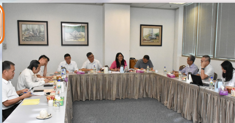
STA Panel Products Committee Meeting No 1/2019, Wisma STA, Kuching, 8 March 2019