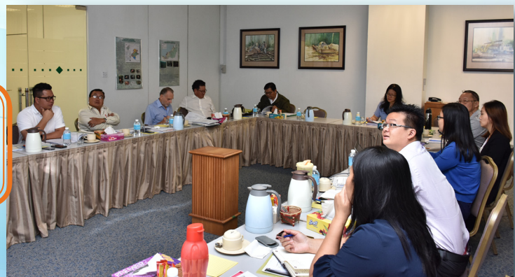
STA Forest Management Certification Working Group Meeting No 1/2019, Wisma STA, Kuching, 13 August 2019