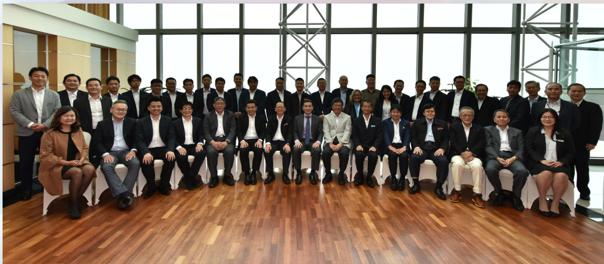
22 nd Tri-Nation Joint Meeting of Japan Lumber Importers' Association (JLIA) / Japan Plywood Manufacturers' Association (JPMA) / Assosiasi Panel Kayu Indonesia (APKINDO) / STA / Sabah Timber Industries Association (STIA), Wisma STA, Kuching, 19 September 2019