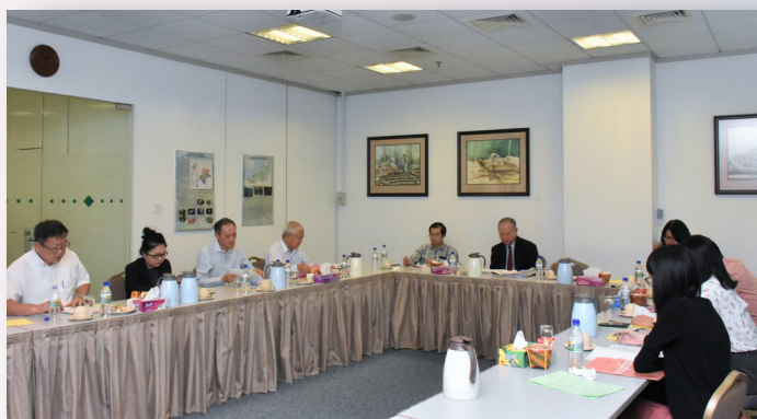
STA Enterprises Sdn Bhd Board of Directors' Meeting No 1/2019