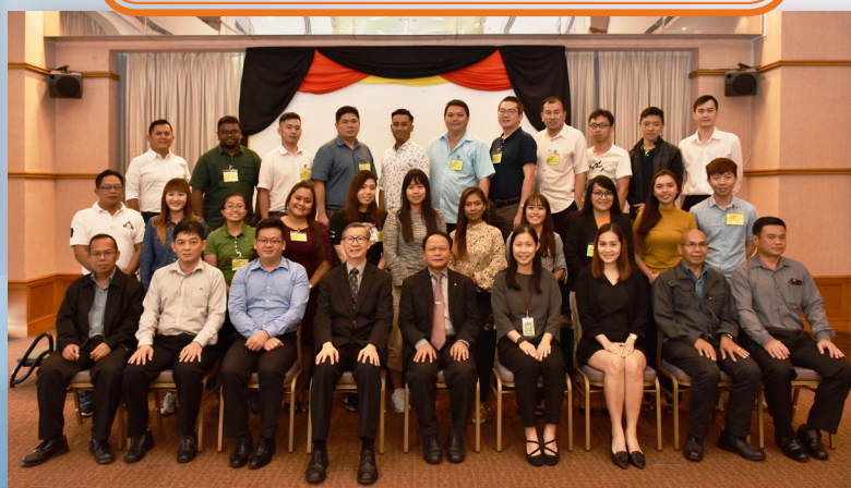
5 th Environmental Compliance Audit (ECA) Training Course, Wisma STA, Kuching, 11-13 November 2019