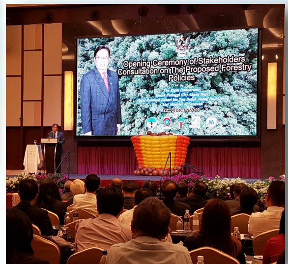
STA participated in the Stakeholders Consultation on Proposed Forestry Policies, Imperial Hotel, Kuching, 22-23 January 2019