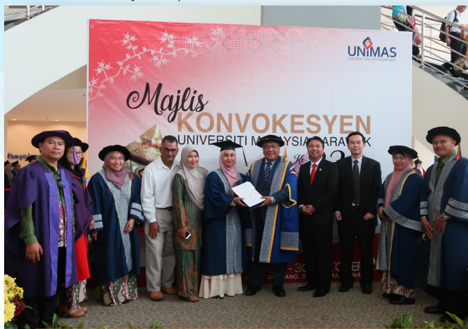
Presentation Ceremony of STA Prizes to 2 students from the Faculty of Resource Science and Technology, Universiti Malaysia Sarawak (UNIMAS), 29 October 2019