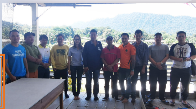
STA participated in the Awareness Programme on Sustainable Forest Management (SFM) and Forest Management Certification (FMC) at Kastima Forest Management Unit (FMU), Belaga, 20-21 August 2019