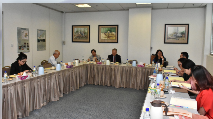
STA Mutual Sdn Bhd Board of Directors' Meeting No 1/2019