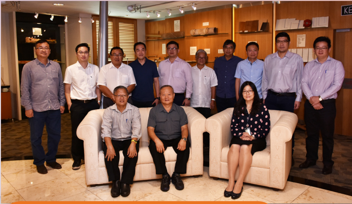
STA Hill Logging Committee Meeting No 1/2019, Wisma STA, Kuching, 17 September 2019