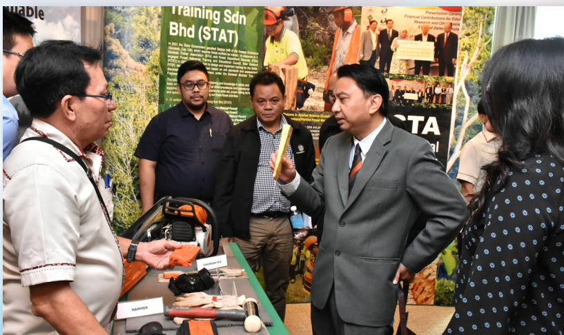
Briefing on Skills Training in Support of Section 51 of The Forests Ordinance, 2015 (S'wak Cap 71), Wisma STA, Kuching, 12-14 February 2019