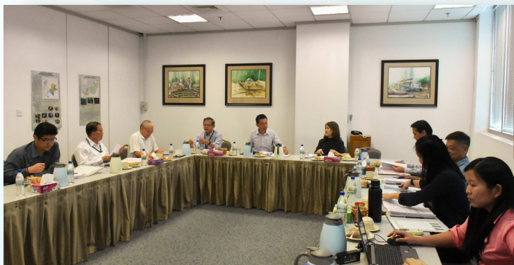
STA Forest Plantation Committee Meeting No 1/2019, Wisma STA, Kuching, 28 February 2019