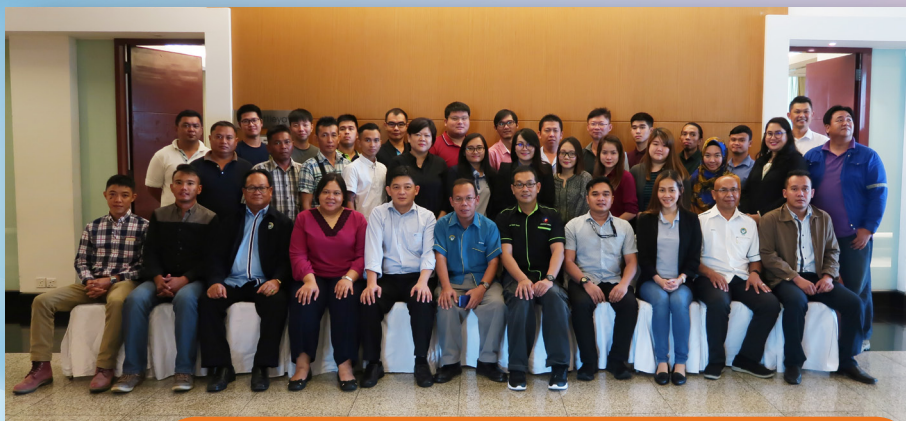
4 th Training on Environmental Quality Monitoring (EQM), RH Hotel, Sibuluan, Sarawak, 2-3 July 2019