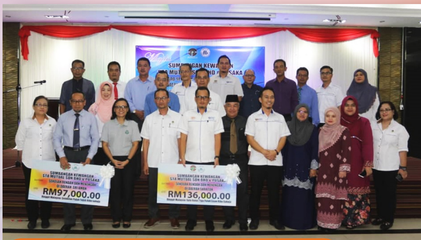
Presentation Ceremony of Financial Assistance to Primary and Secondary Schools in Sri Aman Division and Saratok District, Hotel Seri Simanggang, Sri Aman, 19 July 2019