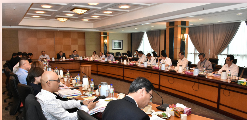
STA Council Meeting No 1/2019, Wisma STA, Kuching, 5 March 2019