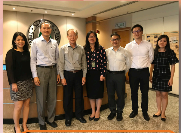
Visit from Malaysia - China Business Council, Wisma STA, Kuching, 17 September 2019