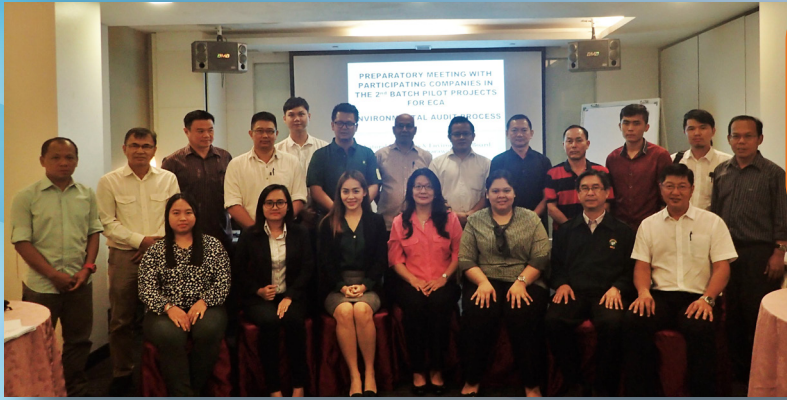
Preparatory Meeting for STA member companies participating in the 2 nd Pilot Projects for Environmental Compliance Audit, Tanahmas Hotel, Sibul, 14 February 2019