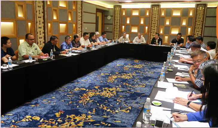
Licences for Planted Forests Holders' Quarterly Meeting No 1/2019, Nu Hotel, Bintulu, 25 January 2019