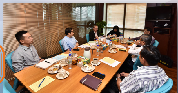
STA Sales and Service Tax (SST) Technical Committee Meeting No 2/2019, Wisma STA, Kuching, 27 September 2019