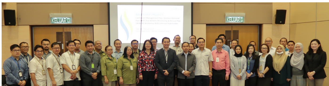
Participants at the Baleh HEP Workshop

The Baleh HEP is scheduled to be completed by year 2026.