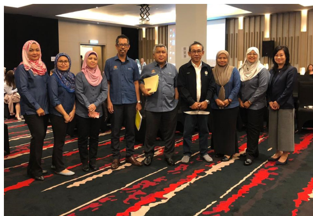
Participants of the Miri Town Hall Session

人力资源部（MoHR）于2020年2月10日假美里铂尔曼海滨酒店举办研讨会，以收集参与者对人力资源部所提出的政策和修订的反馈。