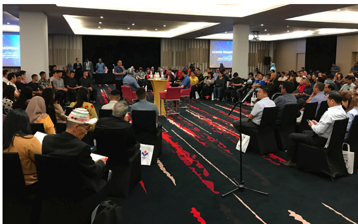
Miri Town Hall Session in progress

Before the Session in Miri, two (2) other Town Hall Sessions were conducted by the MoHR in Kuala Lumpur and Penang. The STA Secretariat has circulated the relevant documents incorporating comments gathered by MoHR for the abovementioned three (3) Town Hall Sessions to members on 13 February 2020 for feedback.