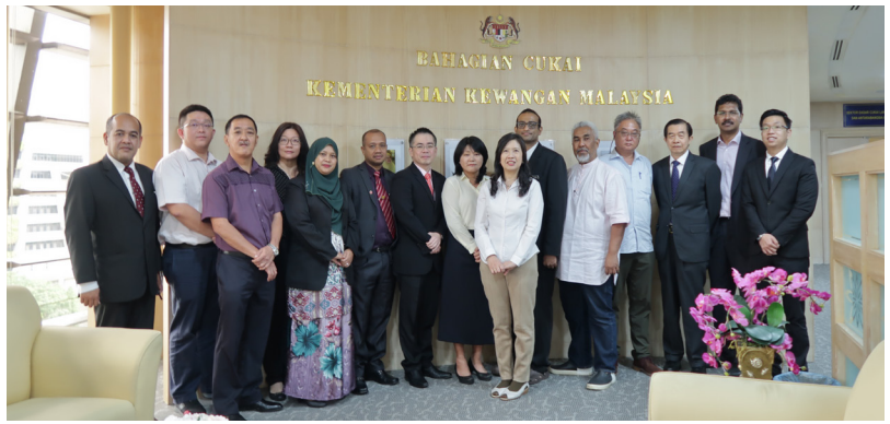
Participants of the meeting