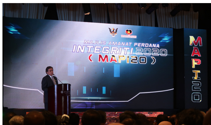
Chief Minister delivering his Opening Speech

The event also saw the launching of the Association of Certified Integrity Officers, prize presentation ceremony for a writing contest on the subject of integrity and recitation of the Pledge of Integrity.