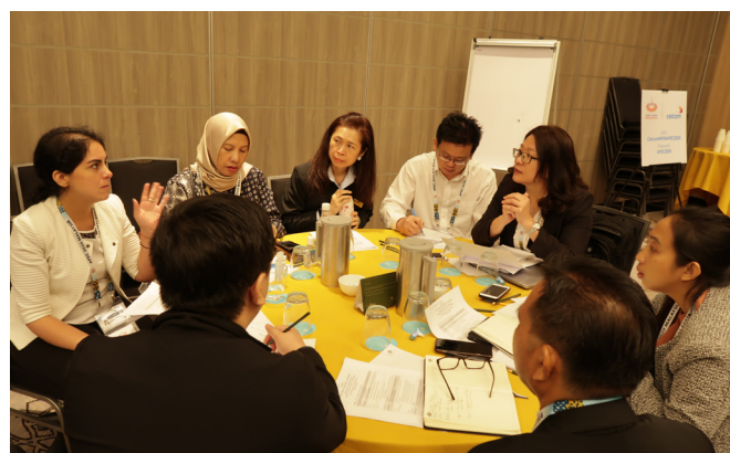
Interactive “World Café” session

Several interactive “ World Café ” sessions were also held during the Workshop to gather inputs and perspectives from the participants on various topics including issues on trading legal timber as well as tools or resources in dealing with legal timber trade.