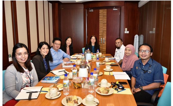
Meeting between NIOSH and STA