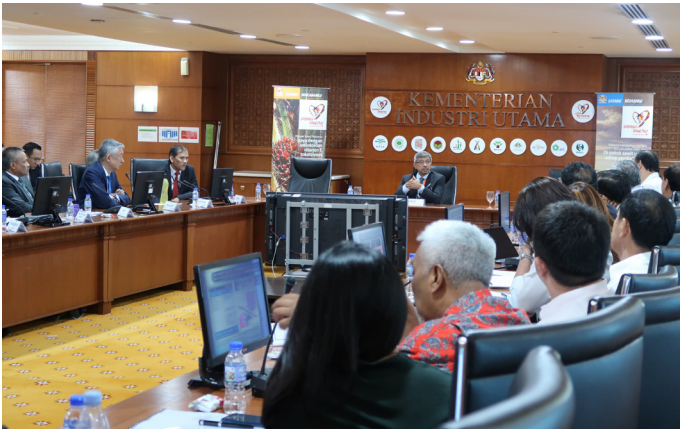
Meeting in progress

MPI shall lend its support to the industry with a letter to the MoF to strengthen the industry's application, before the industry meets with representatives from the Tax Division of MoF in February 2020.