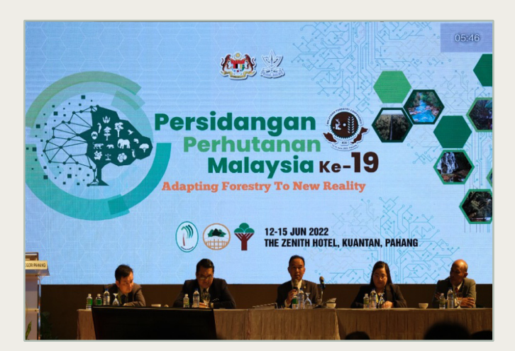
Panelist at the Conference