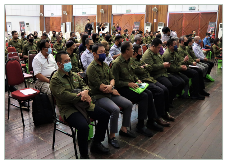
Participants at the FDS' Integrity Day 2022

FDS' compliance to ISO 37001 ABMS will be carried out in the Kapit region in August 2022. The scope of audit will cover approval process for issuance of Permit to Enter Coupe (PEC) and Royalty Assessment using Sarawak Logs Tracking and Forest Revenue (REVLOG) System at Mabong and Melatai Forest One Stop Compliance Centre.