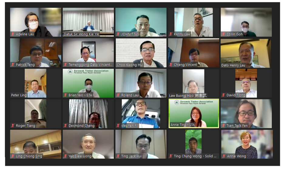
Council meeting in progress

The Council in this meeting deliberated on the amendments to the STA Constitution which were recommended and successfully approved by the Registry of Societies Malaysia (ROS) on 8 April 2022. The Council decided that the voting for Clause 8(1)(a)(i) of STA