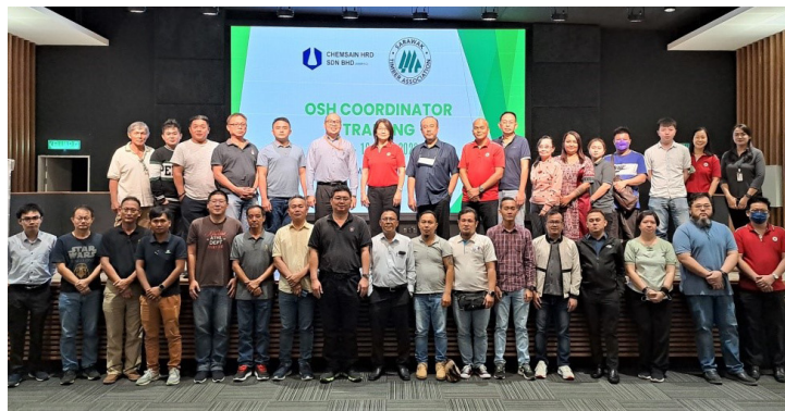
Photo call during the opening of OSH Coordinator Training