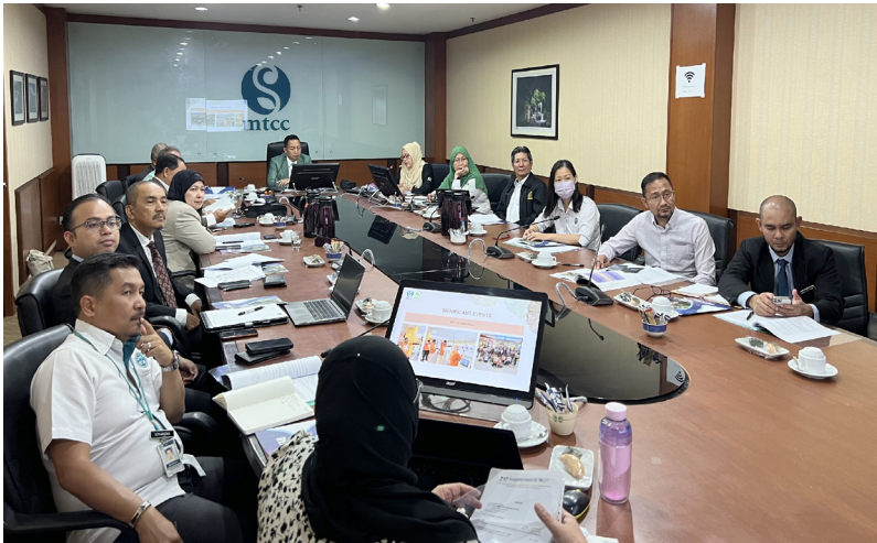
Meeting in progress