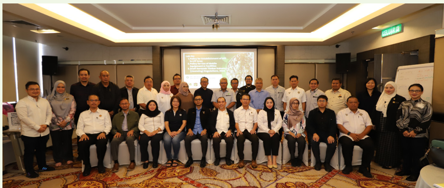
Group photo of participants from Ministry of Natural Resources and Urban Development (MUDeNR), Ministry of International Trade, Industry & Investment (MINTRED), Forest Department Sarawak (FDS), STIDC, Land and Survey Department, Harwood Timber Sdn Bhd and STA during Lab session.

The draft regulation was formulated following the amendment of the STIDC Ordinance, which was approved by the Sarawak State Legislative Assembly on 23 November 2022 and came into effect on 1 June 2023. The amendment introduced the Timber Industry Licence, granting STIDC full authority to regulate the timber industry, including sawmills operations.