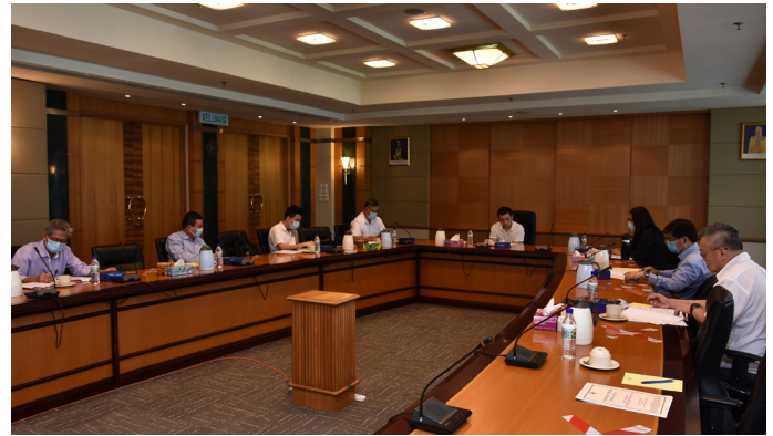
Meeting in progress

The Meeting agreed that plywood members must continue to seek the Government's intervention to assist the timber industry especially plywood manufacturers whose production volumes have decreased drastically due to reduction in the demand for plywood from Sarawak arising from uncompetitive pricing and high production costs.