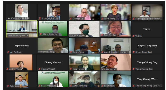
Meeting in progress

In accordance with Article 8(e)(i) of the STA M&A, appointment of the Election Committee to carry out the election of Council members shall take effect on 17 May 2022.