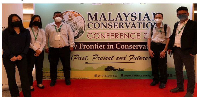
STA Secretariat and some of the representatives from STA members present at the Conference

砂拉越林业机构有限公司(SFC)于2022年3月29日至31日假古晋帝宫酒店主办以“保护新前沿：过去，现在和未来”为主题的首届马来西亚保护大会(MCC)。大会总共通过了12项关于生物多样性保护和养护的决议。