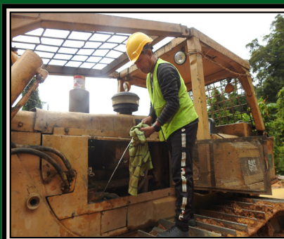
Skills set: Log Extraction - Tractor (Natural Forest) Activity: Tractor maintenance shown by one of the workman of Pasin Camp, Song.

STA Training Sdn Bhd (STAT), a subsidiary company of STA, offers training to workmen in the forestry and timber industry. STAT is the appointed training provider under The Forests (Trained Workmen) Rules, 2015