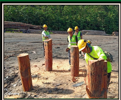
Skills set: Tree Felling - Chainsaw (Natural Forest) Activity: Scarf making practice during training conducted at Muput Camp, Tatau