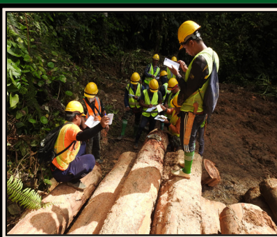
Skills set: Log & Timber Identification Activity: On-site log and timber identification at Entulu-Melatai FMU, Putai