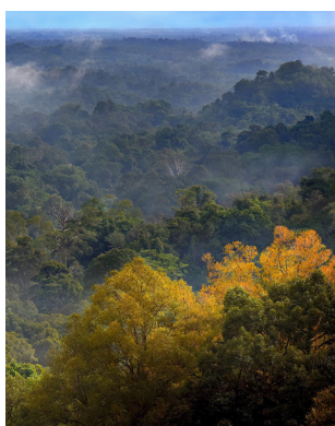
Location: Serian

is a monthly magazine published by Sarawak Timber Association (STA) for its members. While every effort has been made to ensure that the information printed in this magazine is accurate and correct, neither STA nor its Council Members, Officers or Employees shall assume any responsibility or be made liable for any inaccuracies and errors printed; nor is such publication, unless otherwise stated, necessarily the views of STA, its Council Members, Officers or Employees. The contents of the STA Review may be reprinted with prior written permission from STA.