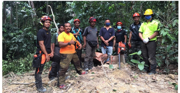
Practical and assessment sessions at the logging concession area in Ulu Lepar, Pahang

The technicians from Husqvarna Malaysia briefed the participants on a chainsaw's components, its functions and maintenance. Tree fellers can only benefit from optimum use of chainsaws if they understand the components well and the chainsaw is regularly maintained.