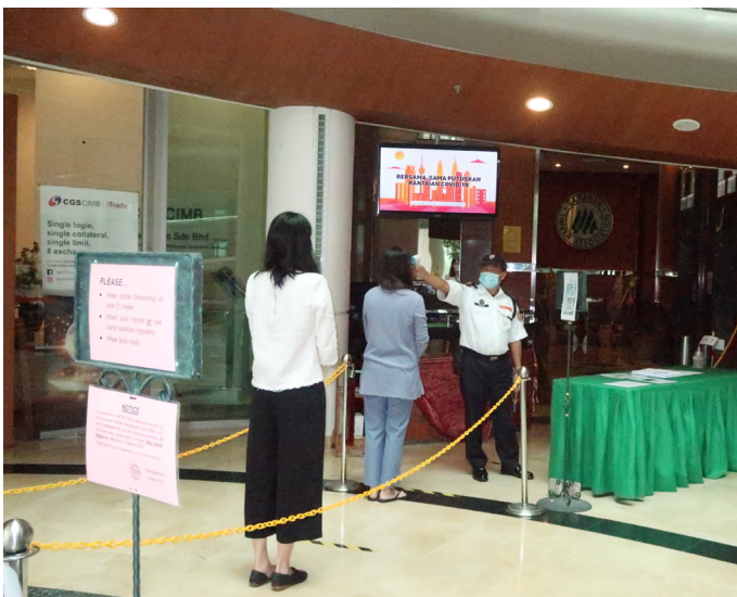
Compulsory body temperature screening

Equally, in order to shoulder the challenges with the tenants of Wisma STA during this COVID-19 crisis, STAE has also provided relevant rental reductions to eligible tenants for a fixed period of time. With the spirit of shared resilience and responsibility, STAE believes that the adverse impacts of COVID-19 will eventually be quelled.