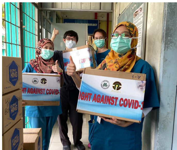
Laboratories of Sarawak General Hospital (SGH), Kuching, receiving the test kits

Both STIDC and STA hoped that the donation of test kits together with the personal protective equipments (PPEs) contributed in April 2020 will help to support the current healthcare needs in Sarawak, protect our frontliners and flatten the curve of COVID-19.