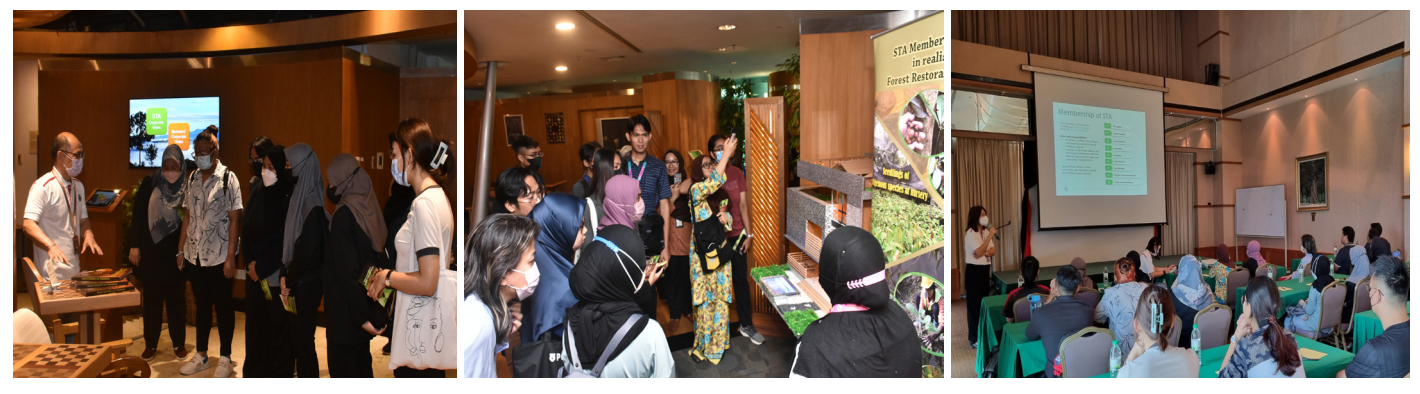
(First and Second Photo) Students exploring some of the exhibits at the Exhibition Centre; (Third Photo) Briefing in progress

The Briefing ended with a question and answer session. The students participated with enthusiasm when asking questions on the roles and functions of STA, as well as issues on planted forests.