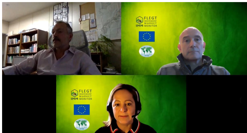
Webinar in progress

At a webinar on 20 October 2020, the Independent Market Monitor (IMM) introduced two (2) new, innovative and freely accessible online timber trade data tools, namely the IMM Data Dashboard (IMMDD) and the Sustainable Timber Information Exchange (STIX). The introduction of both IMMDD and STIX means stakeholders will be able to access accurate and timely information on timber trade flows in near real-time, which is especially crucial during the period of extraordinary global disruption caused by the COVID-19 pandemic.