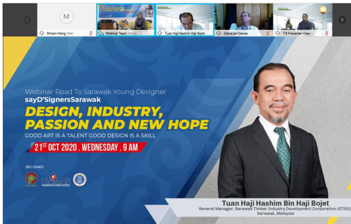
Webinar on SayD'SignersSarawak training programme to uncover new talents in furniture design and beyond

A Webinar on Road to Sarawak Young Designer (SayD'SignersSarawak): Design, Industry, Passion and New Hope was organised by Sarawak Timber Industry Development Corporation (STIDC) on 21 October 2020.