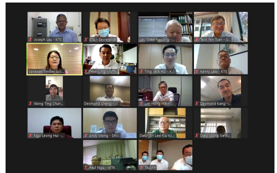
Virtual meeting in progress

The Meeting was updated on forestry matters including policy on forest beyond timber, final draft of the revised harmonised reduced impact logging guidelines, restoration programme within licensed area and new rules for employees' minimum housing standards in Peninsular Malaysia.