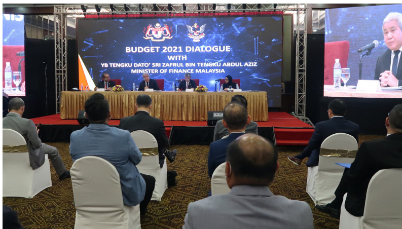
Engagement Session in progress

The EPU Sarawak received a total of eighty-two (82) issues from various chambers and associations. As not all issues were discussed in this Engagement Session, EPU Sarawak shall compile and submit all these issues to MOF.