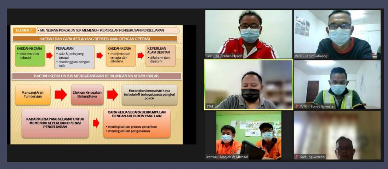
Day two breakout session for Tree Felling-Chainsaw (Natural Forest) & Clear-Fell Site Preparation-Chainsaw (Planted Forest)

STA member companies who wish to nominate their in-house trainers to undergo the online revision session can submit names to STAT for arrangement.