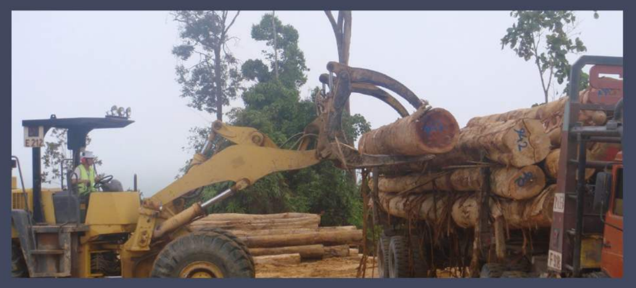
Skills set: Log Loading - Front End Loader (Natural Forest), Activity: Loading Log Onto Log Truck At The Landing Site

The session is designed with the aim to strengthen knowledge and upsurge teaching efficacy among existing in-house trainers who will be training their operators on various forestry activities specifically tree felling, log extraction, log loading, etc. It is initiated as a coaching-mentoring session to provide guidance and opportunities to develop and hone specific skills sets that are essential to being a proficient and confident in-house trainer.