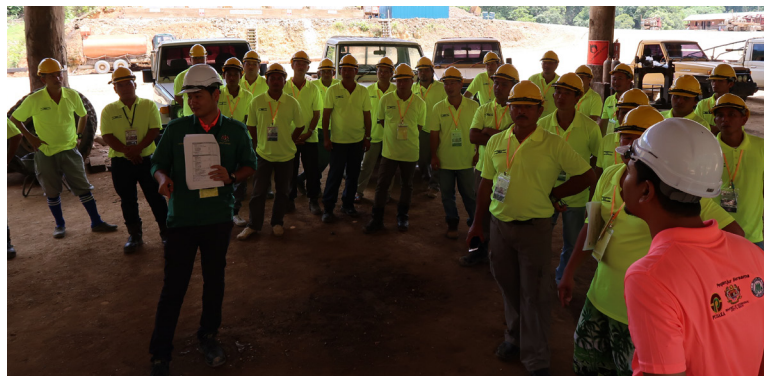
Photo (left): Participants of the Campaign guided through the exercise of identifying hazards in workplace through HIRARC; (right): Participants listened attentively to an explanation given by DOSH Officer during ground inspection.

The 7th series of Occupational Safety and Health (OSH) Campaign for the Timber Industry was jointly organised by Sarawak Timber Industry Development Corporation (STIDC), Department of Occupational Safety and Health (DOSH) Sarawak and Sarawak Timber Association (STA) from 13 to 14 September 2017 in Berkakap Camp, Kapit.