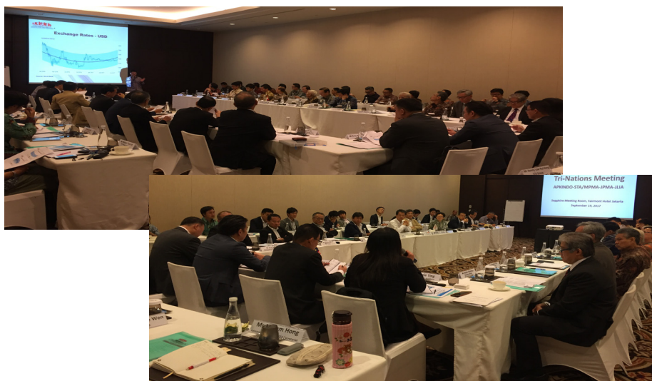
Photo (top and bottom): Meeting in progress

The 20th Tri-Nation Joint Meeting of Japan Plywood Manufacturers' Association (JPMA), Japan Lumber Importers' Association (JLIA), Assosiasi Panel Kayu Indonesia (APKINDO) and Sarawak Timber Association (STA) was held on 19 September 2017 at Fairmont Hotel, Jakarta, Indonesia.