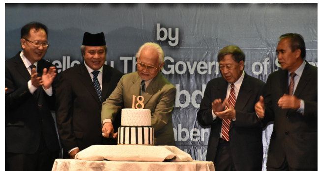
Photo (left): Representative from one of the selected Social and Welfare Organisations receiving the mock cheque; (right) His Excellency cutting a slice out of the birthday cake presented to him for his 81st birthday

Sarawak Timber Association (STA), in collaboration with Forest Department Sarawak (FDS) and the support of officers from the Astana Negeri Sarawak, State Protocol, Public Relations Unit and other related government agencies organised a "Presentation Ceremony of Sarawak Timber Association's Financial Contributions to Social & Welfare Organisations" in conjunction with the 81st Birthday Celebration of His Excellency The Governor of Sarawak, Tun Pehin Sri Haji Abdul Taib Mahmud on 14 September 2017 at the Pullman Hotel, Kuching.