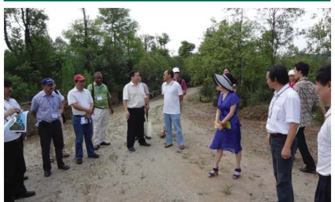
Photo: Welcome by the owners of Dragon Pearl Island Sandalwood Industrial technology Corporation Limited, a private sandalwood research base for sandalwood.