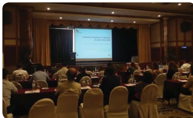
Photo: Seminar in Progress

研讨会的目的在于提高公众对技能培训及政府通过技能培训提升马来西亚劳动力素质从而提高技术人员数量倡议的意识和认知。研讨会总共呈现如英文版中所列出的3份简报。