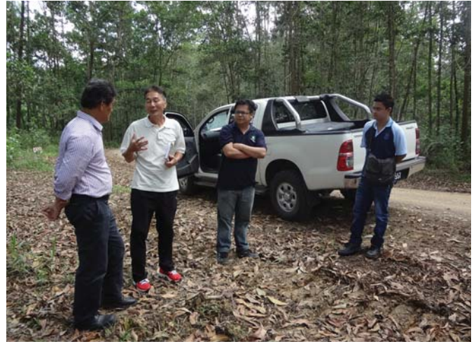
Photo: On-site discussion in LPF 0026 (Subur Tiasa Holdings Berhad)

Issues raised and discussed during the trip included unplantable areas in LPFs, shortage of manpower, pest and disease, machinery problem, supply of good planting material, disturbances caused by local people, and high investment costs. All these problems are hindering the capability of the LPF holders to carry out the trees plantation activities in their licensed areas, and thus slowing down the progress of the tree plantation development under LPF licenses.