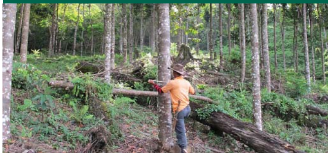
Photo: R&D Khaya ivorensis trial plot

Samling Group of Companies is an integrated forest resource, plantation and wood products company. Headquartered in Sarawak, the Group has an established international presence with strategically located operations in Malaysia, Guyana, New Zealand, Australia and China. We have a long track record of forest management expertise with integrated operations covering the entire wood supply chain from forest resource to manufactured wood products. As a leader player in the natural resources sector, we are committed to creating long-term value under sustainable principles.