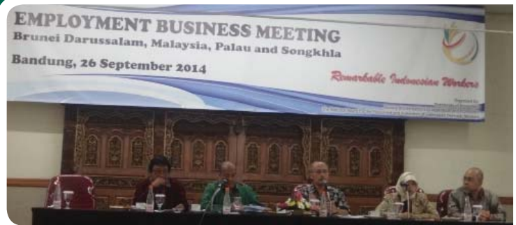
Photo: Panel Discussion in Progress

A panel discussion followed thereafter where the panel shared their views on existing government policies, immigration rules, procedure for the placement and hiring of foreign workers, and job opportunities in Brunei Darussalam, Malaysia, Thailand and Palau.