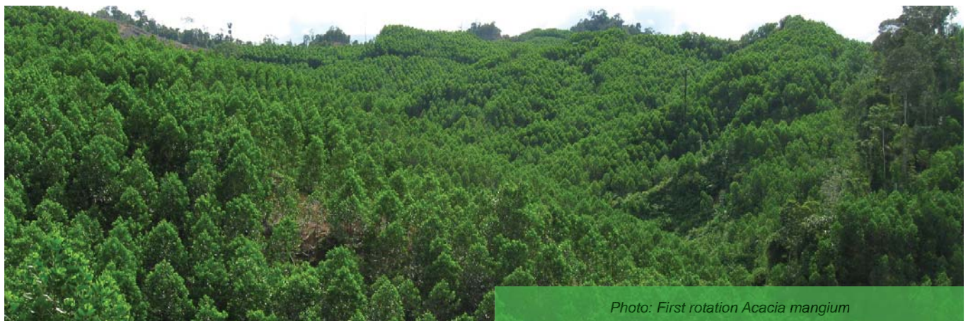
Photo: First rotation Acacia mangium