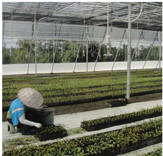
Photo: Eucalyptus cutting production