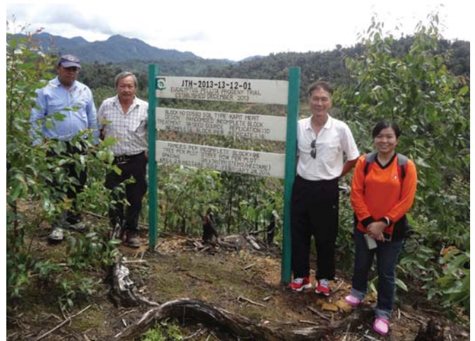
Photo: Group photo at LPF 0028 (Jaya Tiasa Forest Plantation Sdn Bhd)