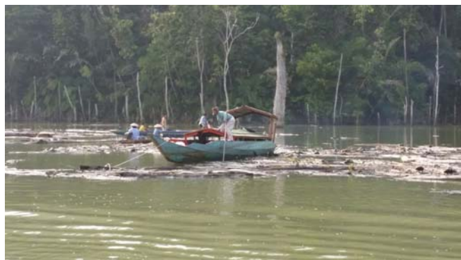
Photo: Tying and dragging the floating debris to the river bank

A community Gotong Royong project was jointly organised by the Ministry of Resources Planning and Environment (MRPE), Sarawak Rivers Board (SRB), SARAWAK FORESTRY, Sarawak Hydro Sdn Bhd, Sarawak Timber Association (STA) and the local community on 19 September 2015 along the river at Long Jawe, Bakun in Bintulu. The purpose of this Project was to clear the floating debris in the Navigation Channel of the river near the village of Long Jawe.