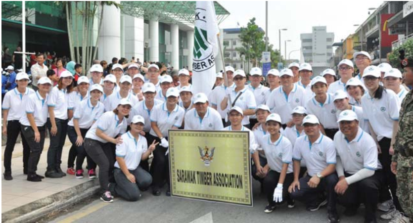
Photo: Group photo of STA Contingent