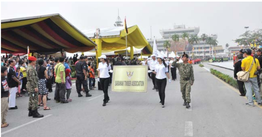
Photo: STA Contingent passing by the Grand Stand

Sarawak Timber Association (STA) participated in the Ceremonial Parade and Grand Rally in conjunction with the 79 th Birthday Celebration of Tuan Yang Terutama Tun Pehin Sri Haji Abdul Taib Mahmud, State Governor of Sarawak on 12 September 2015 at the Sibu Town Square Phase II, Sibu.