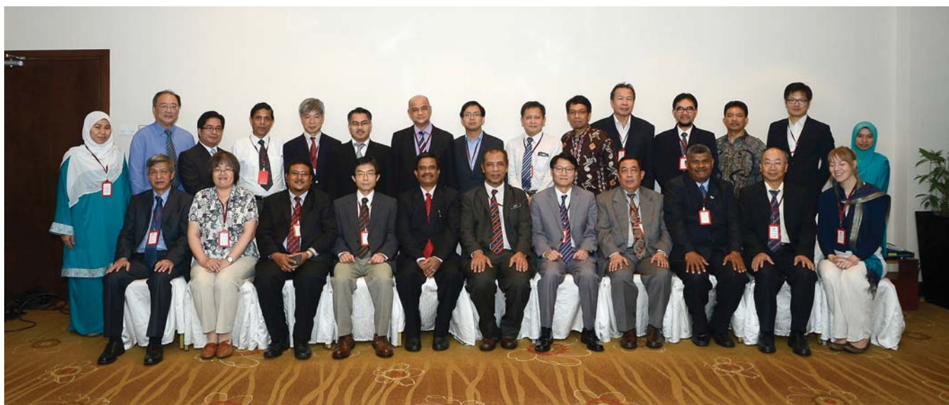
Photo: Delegates to the 7 th General Assembly posing for a group photograph

The 7 th General Assembly of the Asia Pacific Association of Forestry Research Institution (APAFRI) was successfully convened on 20 September 2015 in Kuala Lumpur, Malaysia. Both the Chairperson's Report detailing the activities of APAFRI as well as financial reports were presented to members for adoption at the Assembly.