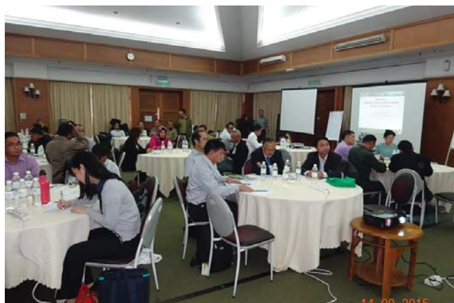
Photo: Workshop in progress

Participants of the Workshop were divided into eleven (11) groups to discuss the 11 main Thrusts and 25 Strategies and 104 Action Plans in the Draft State Forestry Policy in details.