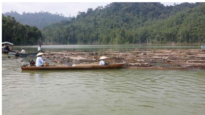
Photo: "Collecting" the floating debris before tying them up at the river bank